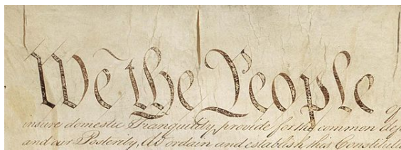
“We the People” in an original edition

the public. [26] This Frame of Government consisted of a preamble, seven articles and a signed closing endorsement.