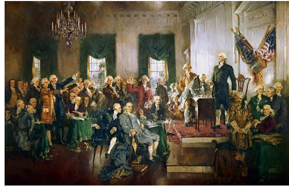
Signing the Constitution, September 17, 1787

On the appointed day, May 14, 1787, only the Virginia